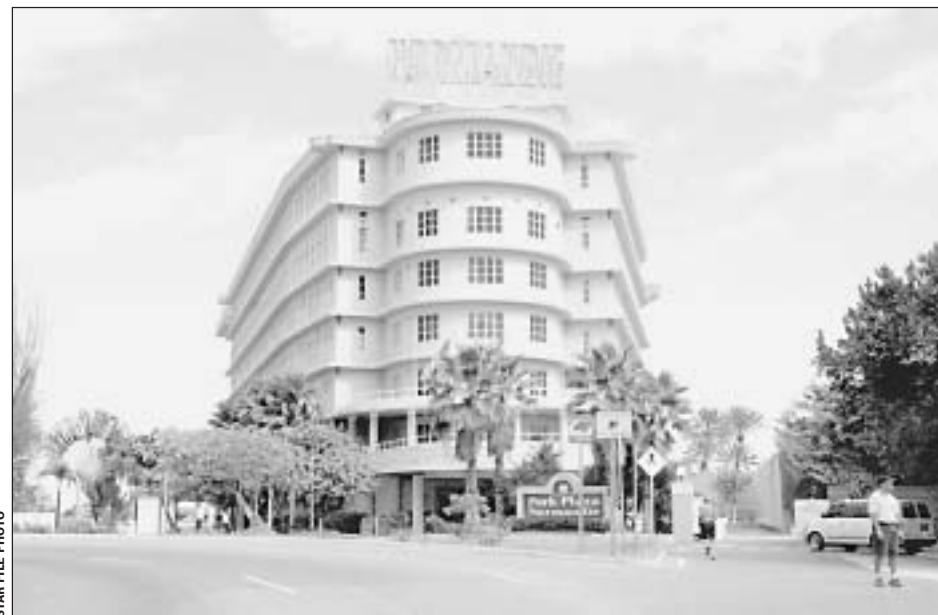
The Normandie Hotel in San Juan will host the conference on Saturday.

Students and young professionals interested in discussing and seeking solutions to the problems that affect Puerto Rico can find more information about the upcoming conference Puerto Rico Minds in Action and register for it at www.harvardmitcaucus.com .